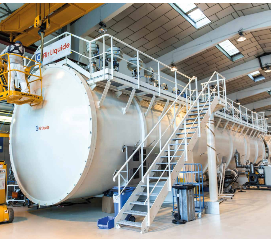
Liquefier cold box

Air Liquide has also designed and built cryogenic equipment for the CERN's LHC in Switzerland and the largest helium production unit in the world in Qatar.