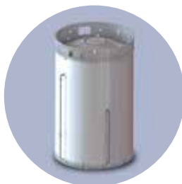
LCH 4 / LOx cryogenic tank