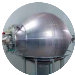
Liquid helium tank