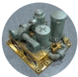
High pressure regulation plate