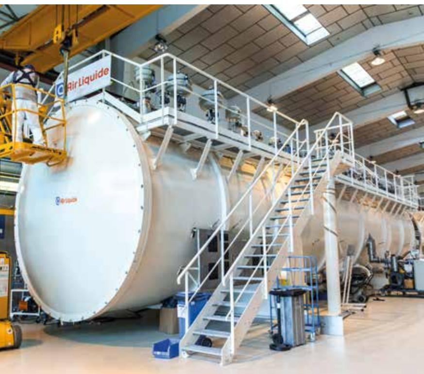
Liquefier cold box

Air Liquide has also designed and built cryogenic equipment for the CERN's LHC in Switzerland and the largest helium production unit in the world in Qatar.