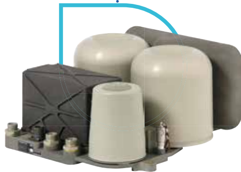
Molecular sieve oxygen concentrator